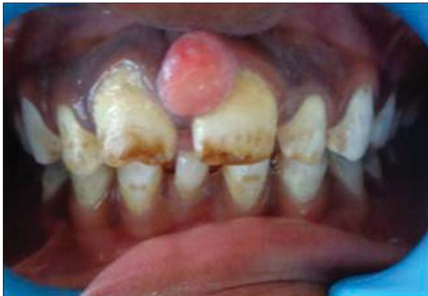
Figure 1: Intra oral picture showing soft tissue growth between maxillary central incisors

Intraoral ossifying fibromas have been described in the literature since 1940s. Many names have been given to similar lesions such as epulis, peripheral fibroma with calcification, POFs, calcifying fibroblastic granuloma, peripheral cementifying fibroma, peripheral fibroma with cemento-genesis and peripheral cement-ossifying fibroma. [4] All the terminologies are appropriate for this tumor as they may contain a variety of calcified material. When bone predominates in the lesion, the term “ossifying” is used.