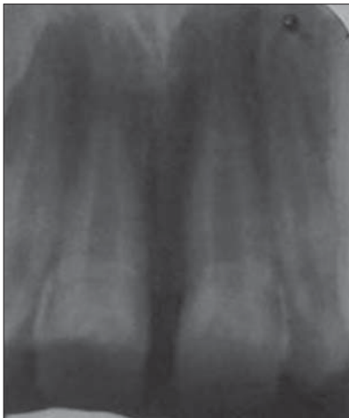
Figure 2: Periapical radiograph showing teeth with normal periradicular architecture

The term “cementifying” has been assigned when the curvilinear, trabecular or spherical calcifications are encountered. However, when both cementum and bone-like tissues are observed the lesions are then referred to as cement-ossifying fibroma. [1]