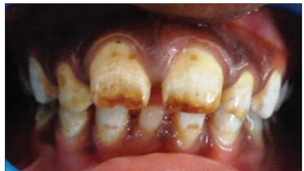
Figure 5: Six months follow-up showing no recurrence