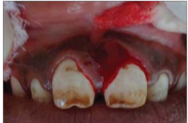
Figure 3: Intraoperative view

POF represents a common gingival growth, usually arising from the interdental papilla and representing up to 2% of all